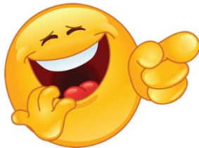
Table Topics & Humorous Speech Contests