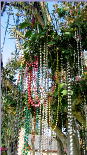
The Mardi Gras Tree: If your Christmas tree is still up, simply redecorate it to celebrate Mardi Gras