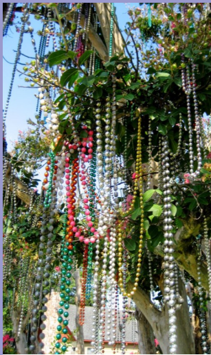
The Mardi Gras Tree: If your Christmas tree is still up, simply redecorate it to celebrate Mardi Gras